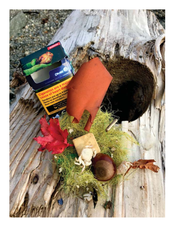
Figure 4. CAJ, "Caught by the Tide," Vancouver Island. Objects: Crab shell, cigarette box, driftwood, bark, chestnut, leaf, eraser, and moss.

Another student, CAJ, created "Caught by the Tide" from a collection of found and gathered objects