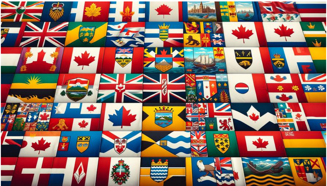
Canadian provinces and territories, including British Columbia, Alberta, Saskatchewan, Manitoba, Ontario, Quebec, New Brunswick, Nova Scotia, Yukon, and the Northwest Territories.

CiiAT headquarters are located in Victoria, British Columbia, Canada. We acknowledge and thank the Lkwungen Peoples, also known as the Songhees and Esquimalt First Nations communities, for allowing us to live, work, and play on their lands.