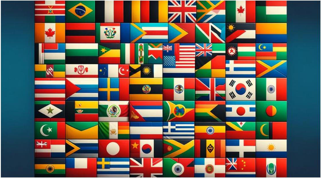
Barbados, Belgium, Brazil, Cayman Islands, China, Cyprus, Dubai (United Arab Emirates), Germany, Greece, Grenada, India, Iran, Israel, Jamaica, Kuwait, Malaysia, Mexico, Namibia, Netherlands, New Zealand, Pakistan, Saudi Arabia, Singapore, South Africa, South Korea, Taiwan, Thailand, United Kingdom, and Vietnam

Our students currently represent 34 countries and 10 Canadian Provinces